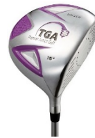
DRIVERS & WOODS.

Golfers in a tournament can carry up to 14 clubs in their bag, here a few of the popular club types and what they would use them for.